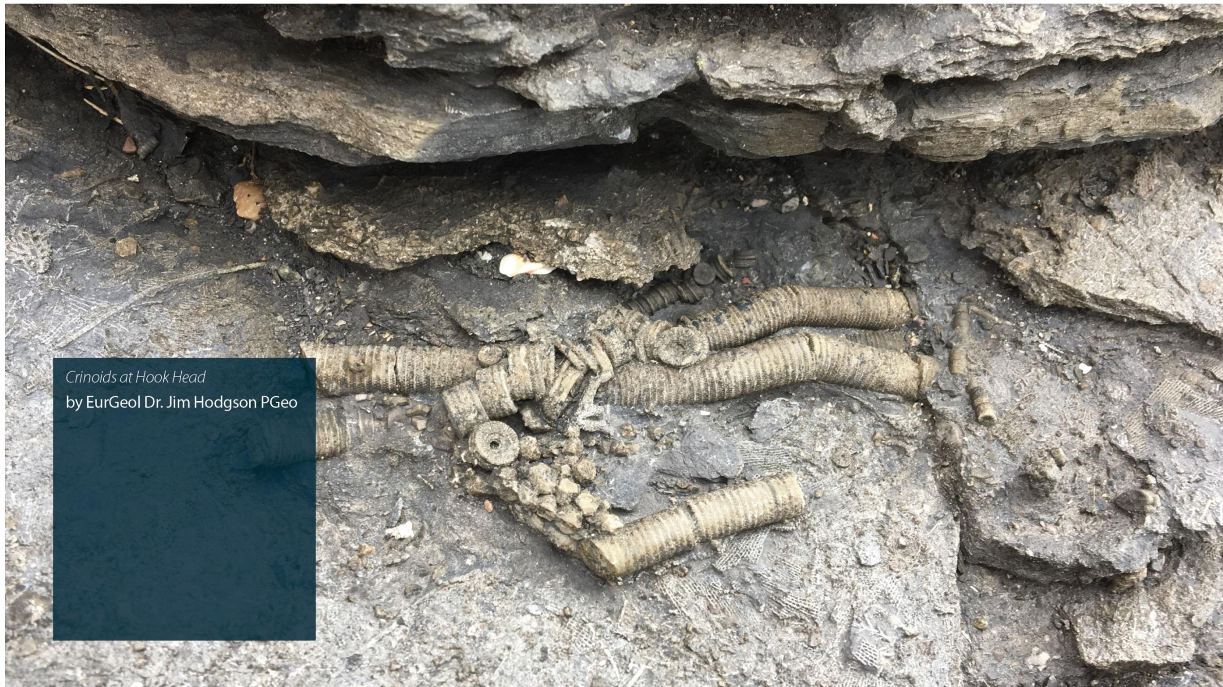
Crinoids at Hook Head